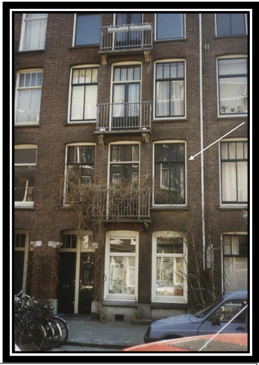
We lived here. At 73 Elizabeth Wolff Straat, A' Dam West

bags made from very heavy paper; bringing them home, on the baggage carrier of our push-bike.