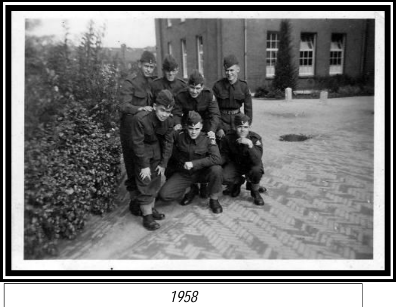
Basic training - Military service in Nijmegen

I did not like the military discipline all that much. I wanted to be free. The officers did not like me all that much either' after I accidentally dropped a radio transmitter from the back of a truck. After that, the last 12 months in the air force was not one of my best times.